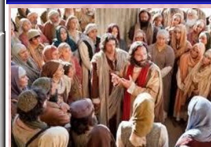
"Peter Preached Boldly"

Every Christian has been given " A Measure Of Faith " (Romans 12:3). While each of us has been given a certain capacity to believe, it can increase. Isn't that great news? Exhibit A for growing faith is the Apostle Peter. Remember what Peter was like in the Gospels? He tried hard but failed, said the wrong thing at the wrong time, and kept messing up at critical moments. Peter was the one who swore loyalty to Jesus then denied even knowing Him (Mark 14:26–31, 66–72). Peter was the one who followed Jesus after His arrest but only from a safe distance (Mark 14:54). When Peter tried walking on the water, he sank, and Jesus called him, " O you of little faith " (Matthew 14:31).