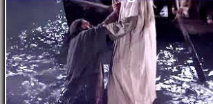
"O You Of Little Faith"