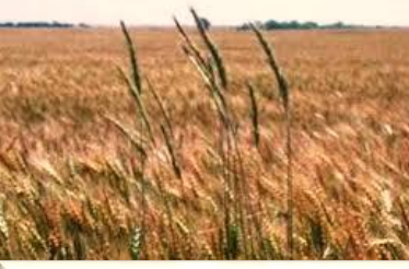
The Ears Of The Darnel Stand Up Straight.

the wheat as well, doing more damage to the crop than leaving the weeds to grow. The ears of the real wheat are heavy and will droop, while the ears of the darnel stand up straight. The grain of the darnel is black, in contrast to the whitish color of the wheat. Also, the darnel is poisonous. It was therefore very important to separate it from the wheat. Because of their resemblance, this could be done only as harvest approaches. You see that we are dealing with two plants which look very similar but are completely different in essence.