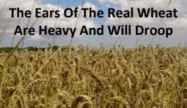
The Ears Of The Real Wheat Are Heavy And Will Droop